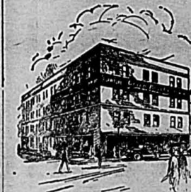
The Pashandle's Largest Furniture Store.

YUKON FLOUR : CANNED GOODS : FEED : SALT