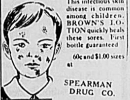
This infectious skin disease is common among children. BROWN'S LOTION quickly heals these sores. First bottle guaranteed. 60c and $1.00 sizes at SPEARMAN DRUG CO.