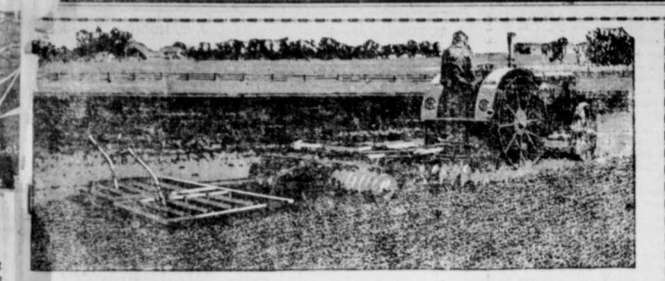
REPAIRS—Bring correct Number or the old part if you expect prompt service in the Repair Depart-ment. All repairs are strictly cash.

Come to our store for your cotton-growing machinery and tools. We will have Cotton planters, single or double row; Harrows; Listers; Cultivators, Disc, spring tooth or shovel; Sweeps, Drags, Hoes—anything you may need in your cotton patch.