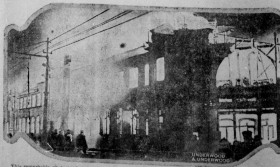
This remarkable photograph was taken during the fire which totally destroyed the central postoffice of Tokio. The loss was about 2,000,000 yen.