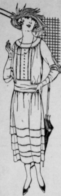
Blouse 1027—30c Skirt 9444—30c

We recommend to all women who are not yet acquainted with the superior merits of these patterns to try one—JUST ONE. It will convince them that the Pictorial Review Patterns fully deserve the reputation they are enjoying all over the country.