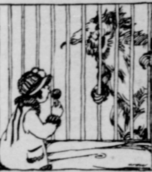
"Queer Looking Candy Things."

"I suppose you don't answer me any more angrily than you do because you