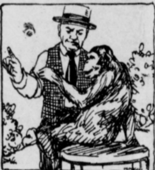
"I Am Proud."

"Even though I am such a big creature I like to be held by my keeper. I suppose I will be heavier than he is one of these days. I'm not sure,