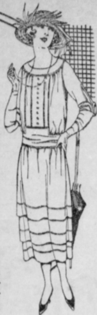
Blouse 1027—30c Skirt 9444—30c

We recommend to all women who are not yet acquainted with the superior merits of these patterns to try one—JUST ONE. It will convince them that the Pictorial Review Patterns fully deserve the reputation they are enjoying all over the country.