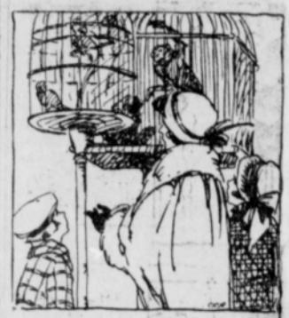
"For a Few Moments."

"that the birds would think it was strange, after they were taken home