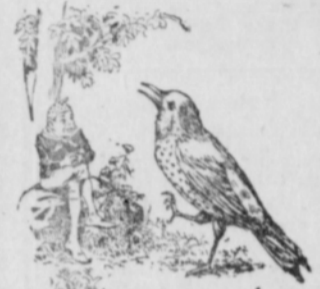
One Day Mrs. Woodpecker Asked the Goblins to Help.

Little Mrs. Woodpecker tried to watch her mate and flew after him