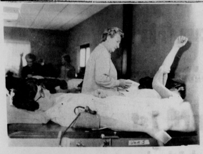
A drop of blood means a lot when you need it. Shown here are donors at the Bloodmobile last week in Spearman.