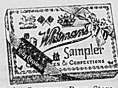
at the Spearman Drug Store.

Saturday night the Spearman girls won from the Perryton girls to the tune of twenty-eight to nine. Exceptionally good playing was exhibited by all Spearman girls—however, the guarding of the Spearman team is reported as being responsible for the low score of their opponents.