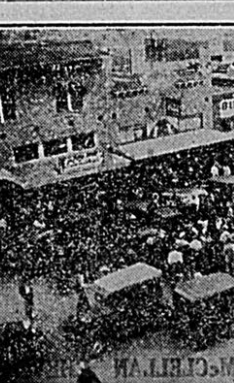
The above picture shows part of the crowd gathered in front of the Spearman Drug Co. last Saturday afternoon. Just waiting to see who would receive the three gifts to be awarded by that store.

Relief workers on the garden tile project are finding plenty of demand for the fruits of their labors. At the present they have 23 tile contracts that call for over 20,000 feet of tile and more orders are contemplated for the near future. Anyone wishing to purchase this concrete tiling for their garden, may buy the tile and have it installed by means of relief labor, for a very reasonable figure. Just get in touch with the local relief board for further information about this.