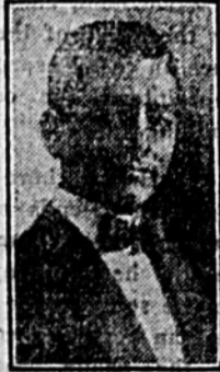
Manuel L. Quezon President Philippine Senate

The people of the Philippines want independence in whatever form they can get it. Manuel Quezon, president of the Philippine senate, declared in an address before that body.