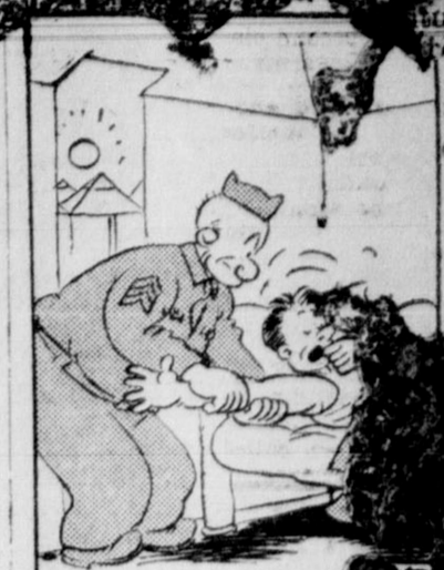
"Yes, dear, I'll go out for a job—tomorrow."

use all their blue tokens... cannot use them.