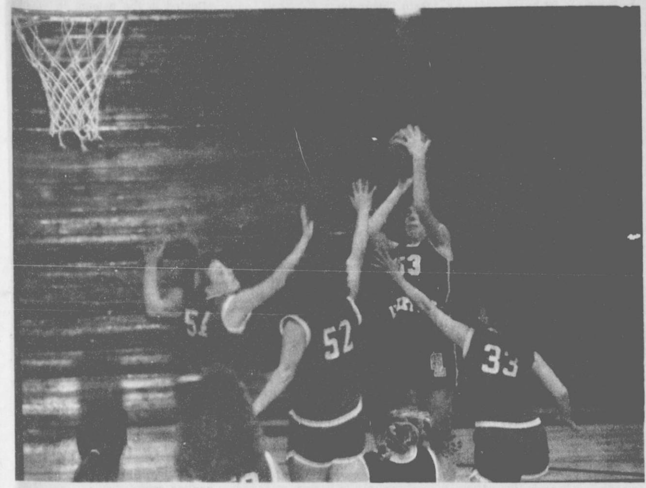
opponets try to block the shot. Two of her team makes more to get a posible rebound. The Lynxette

Game three of the recent Gru-See B-Ball Page 4