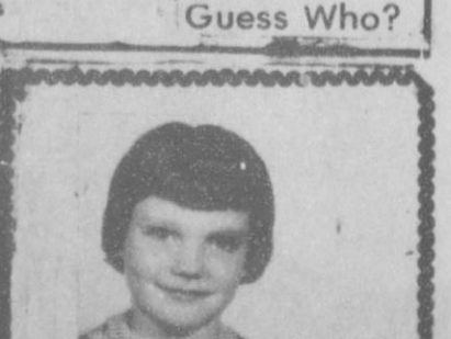
Guess Who's 32???