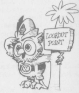
Woody Owl says No Noise Pollution Here!