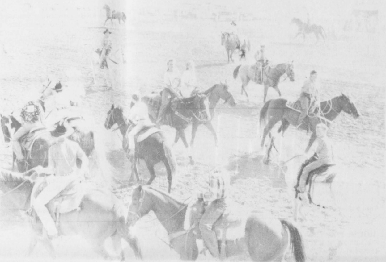
Pre-Rodeo warm up at the Hansford County Junior Rodeo in a time for contestants and horses to get to know each other.