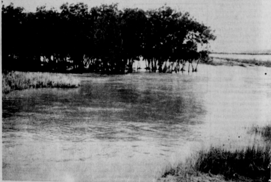
The Palo Duro at flood stage last week. This water could have been impounded in the Palo Duro dam...?