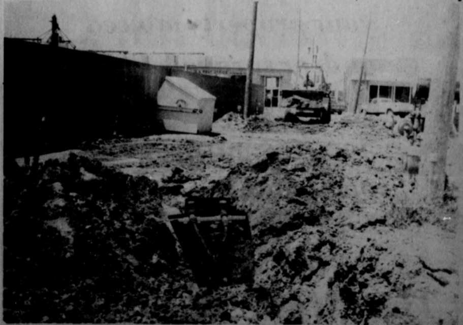
New plastic gas lines were installed on main street last week. The crews finished the installations, and covered the alleys this week! Many gas leaks were repaired, and should be a big savings to the city in the future!