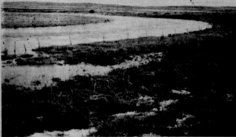
This is the kind of water that you use in municipalities, for washing machines, watering lawns, drinking, irrigation, etc...!