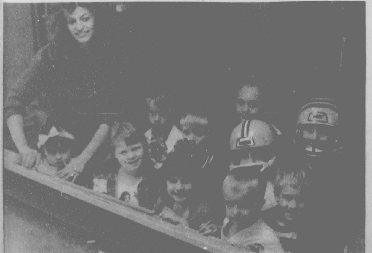
THIS PRE-SCHOOL CREW got a first hand view of what it takes to put out a newspaper when they made a tour of the Spearman Reporter facilities Monday afternoon. The group went through the production

While the official time for moving the clock is 2 a.m. Sunday, most observers of Daylight Savings will move their clocks back prior to going to bed Saturday evening.