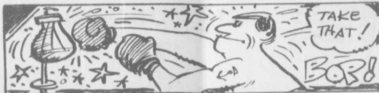
In the 1984 Olympics, U.S. boxers won a record nine of 12 gold medals.

The family requests memorials to be to St. Anthony's Hospice.