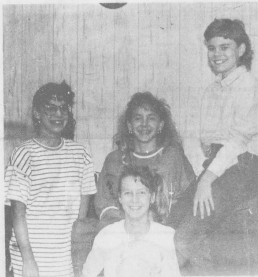
These girls are the new 1989-90 Spearman Junior High cheerleaders. They are [l-r] back