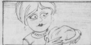
Keep frozen poultry hard-frozen until time to thaw, and cook promptly after thawing.