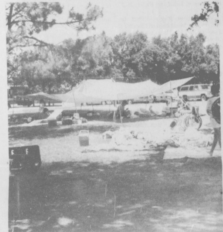
The park lawn was a busy place as swimmers rested, waiting their turn to get into action at the Spearman Swim Meet.