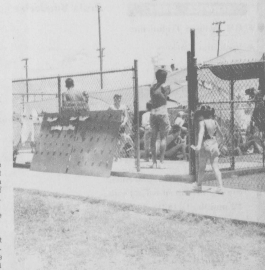
Swimming contestants wait for their turn to participate in the swim meet.