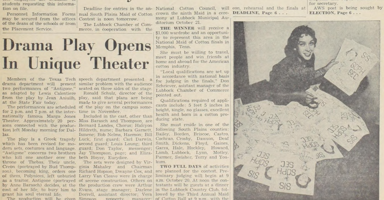
ELECTION TIME — A pretty candidate looks over her posters as she waits for the elections Wednesday. More than 80 candidates are competing for positions in the class offices.