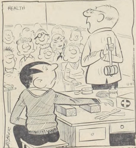
"TODAY'S DEMONSTRATION WILL BE ON HOW TO SET A BROKEN ARM!