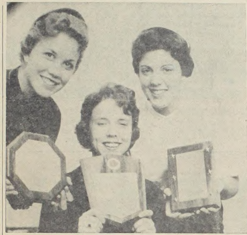
Coeds Display Dad's Day Awards Holiday Events Begin Today

The public is invited to attend the festival. In addition to the show the green houses will be open for inspection.