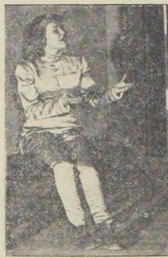
JOHNNY COME LATELIES— to the picture field, these gentlemen did manage to get in the impassioned speech department play "Looney Lorraine" Wednesday and Thursday nights in the Highschool auditorium. Part of the same scene viewed in the cut at left, these actors somehow got separated from their leading lady who

"I can't bear to see the students pulling their hair over a course when the birds are singing and the flowers are budding," said