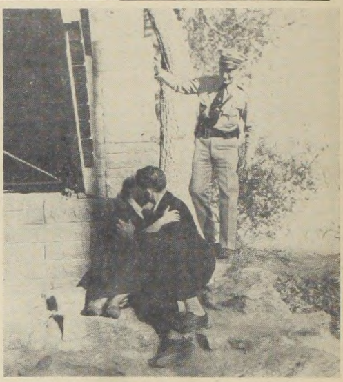
SPORTS—Shown above is the type protection which stu-dents will receive while indulging in their favorite past time from now on. The protection was thoughtfully ordered by Uncle Wiggley.