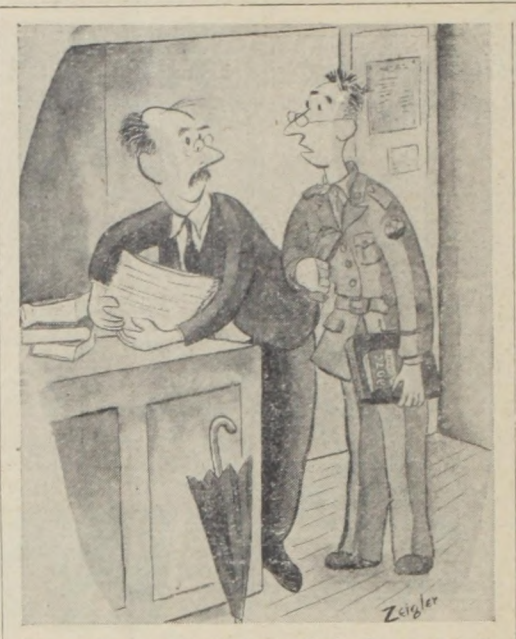
"I was wondering sir, if I might sit next to the door from now on, in the event of a national emergency."