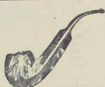
PHIL'S SMOKE SHOP 1/2 Block West of Lindsey Theater 1107-B Main Street

Plans for next year include the acquisition of flashcards to be used by the student body at football games, said Frank Austin, See THANKLESS Page 8