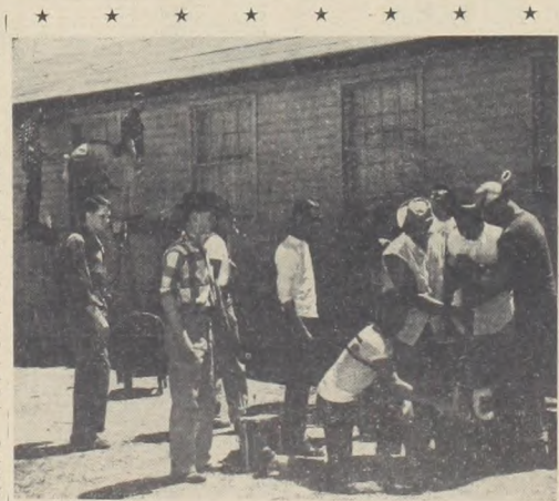
SEEING GREEN?—Los Camaradas members and pledges paint the Rec hall its original green color as no red paint was available. A day's work was spent by the Cams, painting and scraping the building.