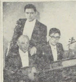
The Aeolian trio which will appear in the weekly Rec hall program at 8:15 tonight is pictured above. The trio will feature music by Mendelssohn, Haydn and Beethoven.