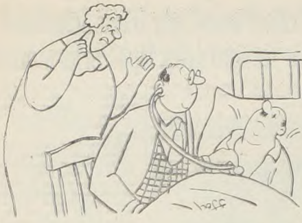
Reprinted from March 1951 issue of Esquire Copyright 1951 by Esquire, Inc.

"I've done my best to cheer him up, Doctor, always telling him to forget losing his job . . . forget the bills piling up . . . forget the threat of ill health . . . forget . . ."