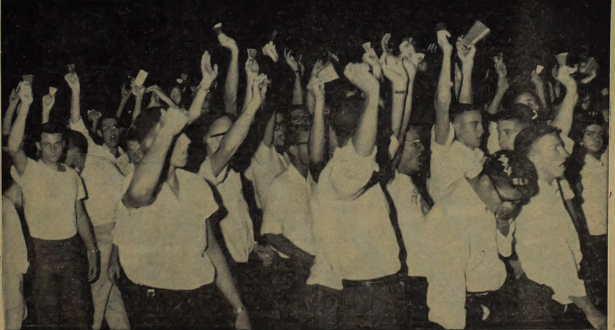
T . . . DOUBLE TROUBLE . . . YEAH, RED . . . YEAH, I freshmen marched to Friday night's pep rally in droves YEAH, BLACK

In the School of Agriculture 680 men and 10 women have enrolled for a total of 690. The School of Arts and Sciences has registered 1280 men and 1539 women for a total of 2819. In the School of Business Administration 1197 men and 336 women have registered, making a total of 1533. Four hundred and sixty-six women have enrolled in the School of Home Economics. A total of 1906 have finished registering in the School of Engineering, with the men outnumbering the women 1857 to 49. The Graduate School numbers 251 men and 91 women in its total of 342.