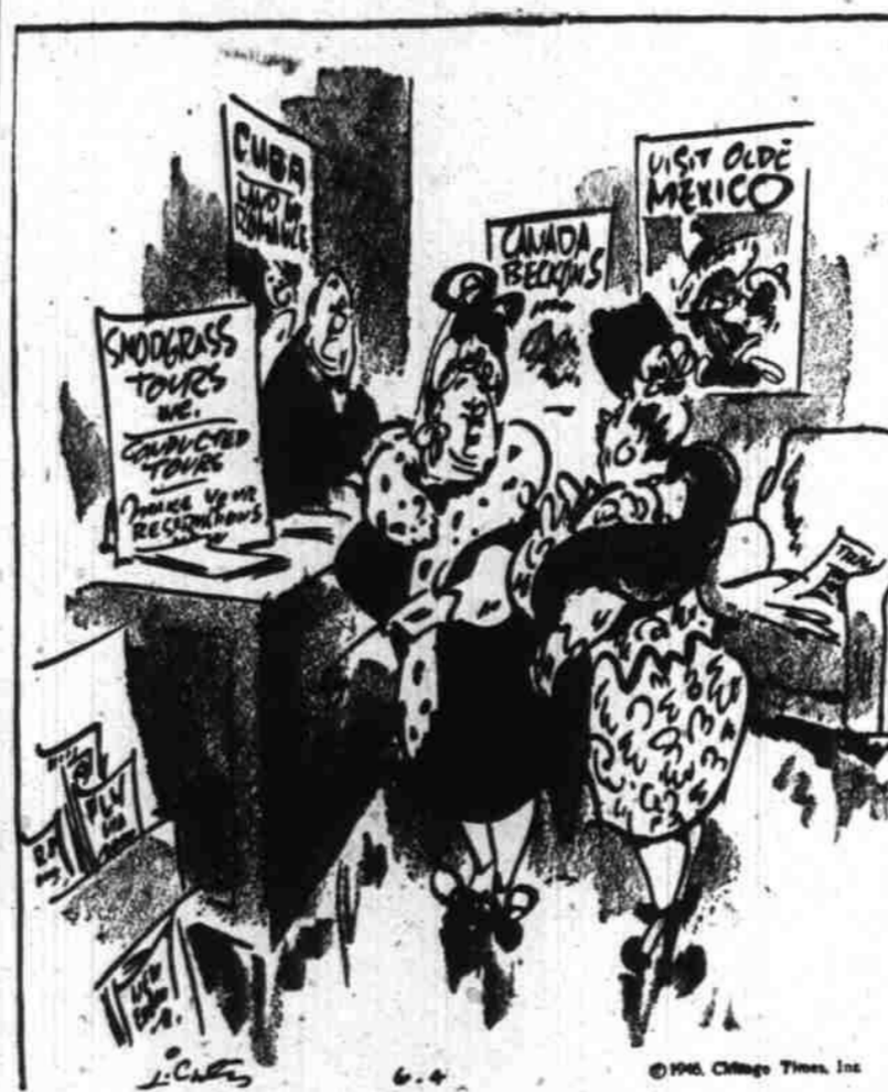
"I can't imagine what's holding them up—He says Europe isn't ready for us yet!"