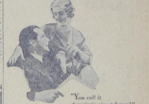
"You call it America's pipe tobacco!"