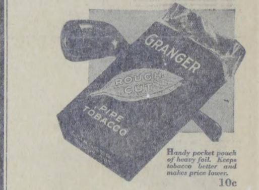
Handy pocket pouch of heavy foil. Keeps tobacco better and makes price lower. 10c

In other words, it's pipe tobacco—and if you're smoking a pipe, you want tobacco made for pipes—not tobacco made for something else, it matters not how good it is.