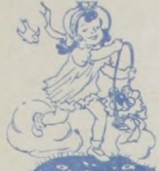
Meet At Windmill

FROM sparkling red hearts placed in the entrance of an Indian kiva in the livestock pavilion, the Ko-Chap-Sou sorority presented 13 pledges Sunday evening. Nab Bedley's Gold-Diggers played for the dancing which was from 9 until the invasion of Doak's peeping toms.