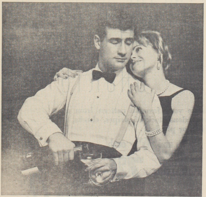
Does a man really take unfair advantage of women when he uses Mennen Skin Bracer?

COLLEGE GIRLS . . . YOU CAN SEND IN YOUR OWN NAME. Or recommend one of your classmates . . . your roommate of your classmates... your roommate one of your classmates... your commate ... your friend. Parents, you can nominate your daughter... or a neighbor who attends callege. All candidates will receive equal consideration by the judges, no matter how the student's name is originally submitted.