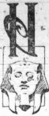
Europe was still the haunt of scattered savages

How would you like to be brought to light 2,000 years after you had been buried and to have the story of your life told again from what was found in your grave? Probably not a thoughtful could be gathered together, not a shred, not even a nail or metal scrap. Yet from the old cemeteries of Egypt the story of an extinct civilization is being wrought out anew. Kings and princes long since forgotten, arts long since lost, an almost endless panorama of a life that was hoary with age centuries before Homer sang, Solomon sat in judgment, while