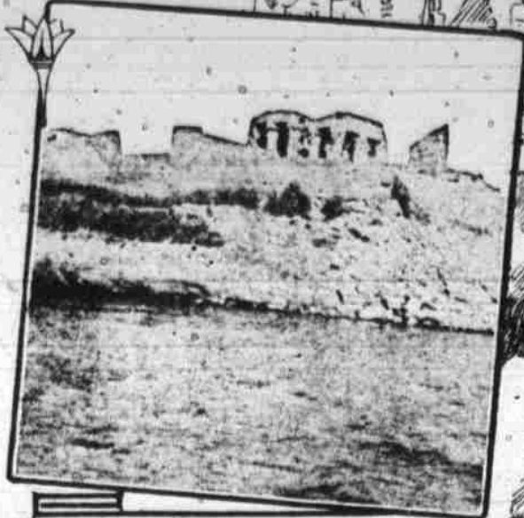
RUINS OF ANCIENT CITY

How would you like to be brought to light 2,000 years after you had been buried and to have the story of your life told again from what was found in your grave? Probably not a thoughtful could be gathered together, not a shred, not even a nail or metal scrap. Yet from the old cemeteries of Egypt the story of an extinct civilization is being wrought out anew. Kings and princes long since forgotten, arts long since lost, an almost endless panorama of a life that was hoary with age centuries before Homer sang, Solomon sat in judgment, while