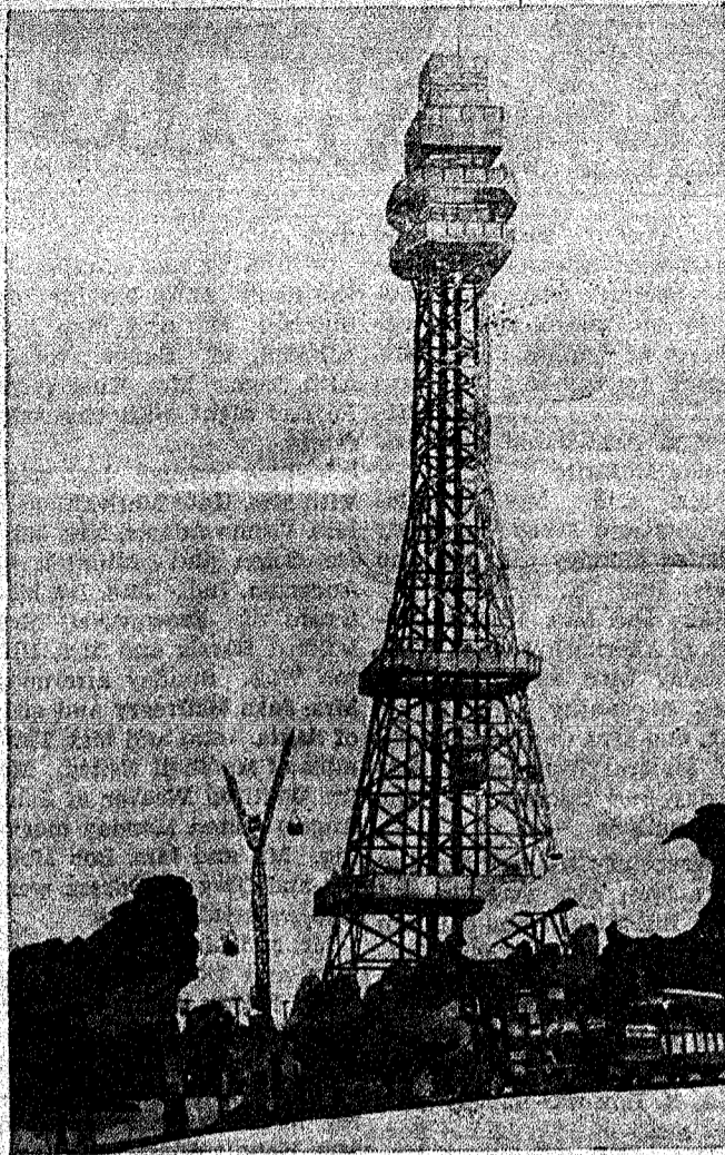
The world's largest land-based oil derrick, which will be Six Flags Over Texas' newest attraction, is seen in this artist's rendering. Construction is already under way on this 300-foot "rig," which will be the tallest single structure at the popular 140-acre, $18,000,000 theme entertainment center located in Arlington, midway between Dallas and Fort Worth.

Arlington, Texas: Six Flags Over Texas will begin its Fall operating schedule on September 7 and will operate on Saturdays and Sundays only until the 1968 season ends on December 1. Operating hours will be from 10 a.m. to 8 p.m.