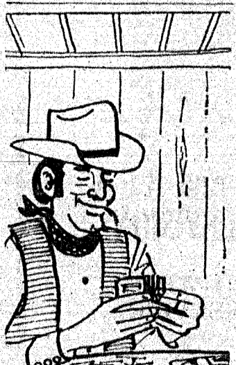
ME'N THE BOYS JUST PLAY POKER FER MATCHES THAT WAY NOBODY GETS BURNED