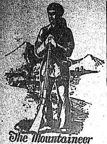
The Mountaineer Regional Meet Scheduled For Today and Tomorrow

The interscholastic league meet for region 2 will convene today and tomorrow, April 19 and 20. Santa Anna has two contestants.