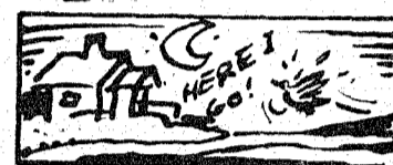
About 300 years ago, some people believed that migratory birds spent their winters on the moon.