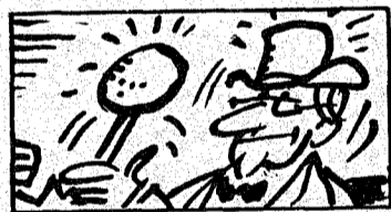
The first recorded presidential opinion poll was conducted at Wilmington, Delaware to determine voters' intentions in the 1824 presidential election.

The Junior Mountaineers play Lometa here this week. They are undefeated and are hoping for another victory Thursday night. The Senior Mountaineers travel to Lometa Friday night. Stay behind them and show your support as they strive to win their last two games.