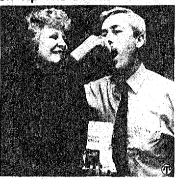
do eat interesting and satisfying.

• FIBER UP: Remember that a good diet is only as good as it's nutritious. So eat foods with high fiber—whole grains, green vegetables, fruits. You'll have renewed vigor!