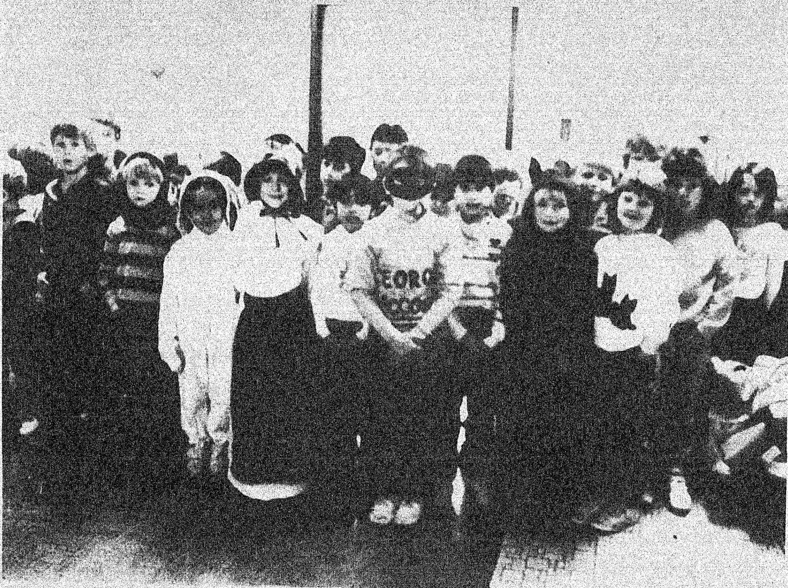
The first grade students of Santa Anna Elementary School visited Ranger Park Inn last Friday giving a program for the residents and presenting them with handmade valentines. 25 children participated in the outing.