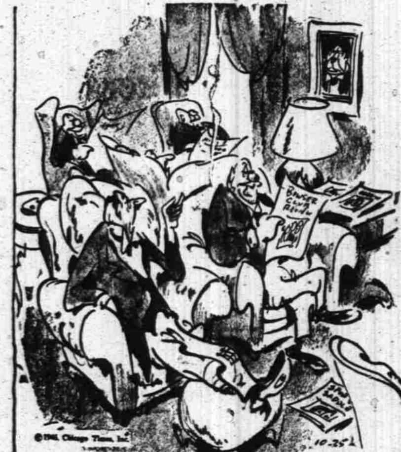
"Innocent folks like us are the worst victims of inflation, Cadwallader—People who in good faith retired on their grandfather's savings!"