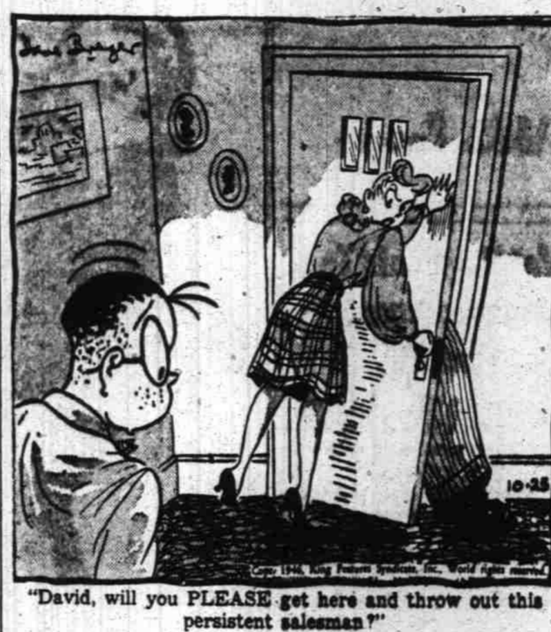
"David, will you PLEASE get here and throw out this persistent salesman?"