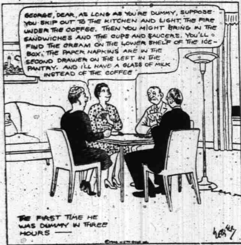
THE FIRST TIME HE WAS DUMMY IN THREE HOURS