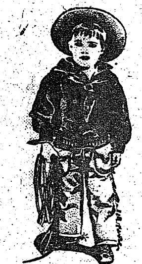
The Texatone Boy

Plenty of screen wire, all sizes, at Polk & Baxter's.