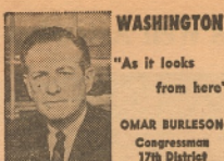
WASHINGTON, D. C. —

GROWING UP ON A FARM WE HAD BEES. Having been told about the duties of the queen, the workers and the drones, they were interesting to watch. (If in that day there had been television, probably the bees would not have been noticed.) But it was fascinating to learn that when the old queen had expired and her usefulness served, the new queen left the hive, followed by the workers who surrounded her on the Mesquite limb where she chose to light.