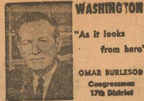
WASHINGTON "As it looks from here" OMAR BURLESON Congressman 17th District

WASHINGTON, D. C. - THOSE WHO HAVE A SON, husband or other loved one in Vietnam are doubly concerned by reports on the use of dope. The dope problem among servicemen is indeed sad but the percentage of those on narcotics is not as great as might be expected from reports. The fact remains that one is too many. In a way it can be rationalized but, of course, not condoned.