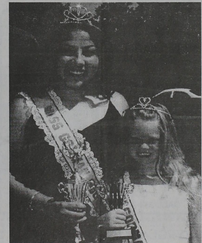
Miss and Little Miss Gorman participant in Rising Star Parade