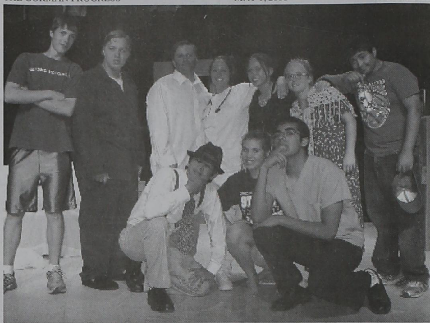
The cast and crew of Gorman High School's One-Act Play competed in the UIL Zone contest on March 26 at Weatherford College. The group performed "Rest in Peace" by Pat Cook. This was a different type of auditorium than usually encountered during UIL contest, but the cast & crew gave their best performance. Although the play did not advance, three members of the ensemble received awards.

Final applications are now being evaluated for the Ten Star All-Star Summer Basketball Camp. The Ten Star All-Star Summer Basketball Camp is by Invitation Only. Boys and Girls, ages 10 - 19 are eligible to apply. College Basketball Scholarships are possible for players selected to the All-American Team. Camp locations include: Commerce, Tx; Prescott, AZ; Thousand Oaks, CA; Babson Park, FL; Gainesville, GA; Champaign, IL; Glassboro, NJ; Lebanon, TN; and Blacksburg, VA. A Summer Camp available for Boys and Girls ages 6 - 18 of all skill levels. For free brochure on Summer Camps, call 704-373-0873 ANYTIME. www.tenstarcamp.com