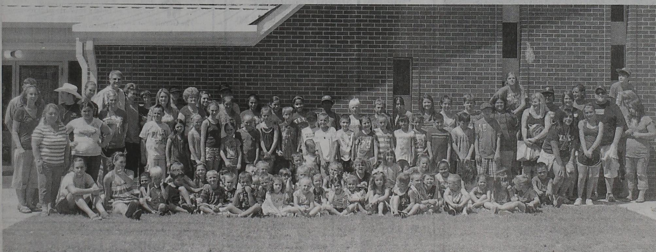
FBC VACATION BIBLE SCHOOL - Thanks to all the Parents for entrusting your kids with us for the week of VBS.

I am also Still Selling raffle tickets on $100 worth of beef from City Grocery and I am selling chances on a gun please call for details. Thankyou!