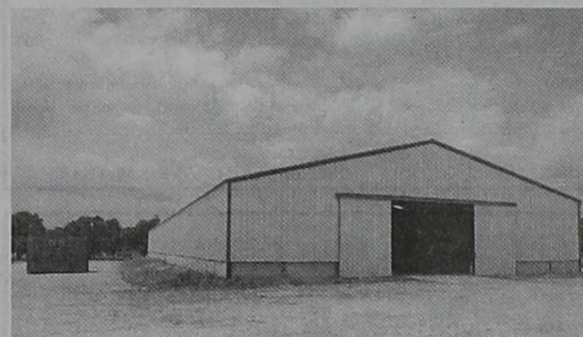
The new Pellet Mill Building for Gorman Milling is still under construction. Campbell Construction is working on the building.

Weight Room Open The High School Coaches Will be opening The weightroom And the gym From 6 to 8 p.m. Mon. thru Thurs. For Athletes To Workout