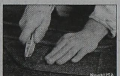
Damaged shingles give pests easy access into your home.

clogged gutters, all of which are as inviting as a "Pests welcome" vacancy sign.