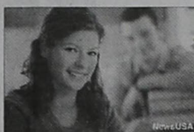
Are you taking advantage of tax breaks for students?

• Biggest cautions: You must be enrolled at least half-time in a degree program to claim it, and - like all these breaks - the benefit starts to phase out once you reach a certain adjusted gross income (AGI). • Lifetime Learning Credit. Eligibility standards for this one are broader, even if it's less generous