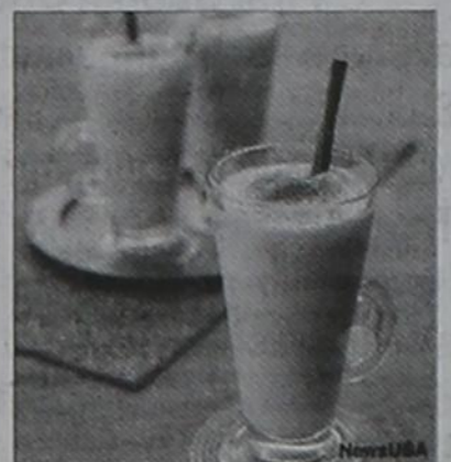
Vanilla Egg Nog is a tasty holiday treat, plus it works toward your daily dairy intake.

"Even people with lactose intolerance do not have to miss out