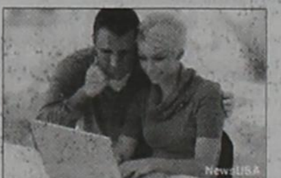
Don't let tax-filing errors cost you extra dollars.

• Reduction in the Energy Savings Home Improvement Credit. At its height, this was a 30-percent credit on the cost of high-efficiency windows, furnaces, central AC and the like. It's now 10 percent. Plus, the maximum lifetime credit went from $1,500 to $500. "That means if you spent a total of $5,000 on IRS-approved upgrades in 2011," says