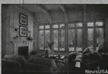
Increase efficiency, style and comfort with one long-lasting home improvement project - window replacement.

According to a survey by the American Institute of Architects,