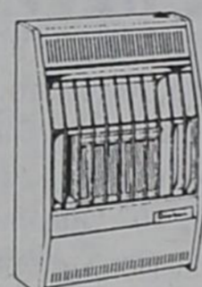
Dearborn Vent-Free Infrared

Warm up those cold and drafty areas this winter with one of these efficient Dearborn heaters designed for safe, economical zone heating.