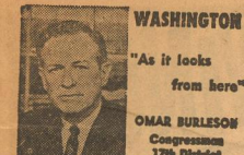
WASHINGTON "As it looks from here"