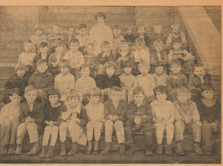
THIS IS THE CLASS OF 1929 - The above is a picture of the Class of 1929. Do you recognize anyone? If so, come to the homecoming on Saturday and maybe you will see some of them.