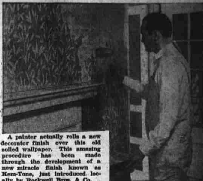
A painter actually rolls a new decorator finish over this old soiled wallpaper. This amazing procedure has been made through the development of a new miracle finish known as Kem-Tone, just introduced locally by Rockwell Bros. & Co.

The University of Chicago was founded in 1881.