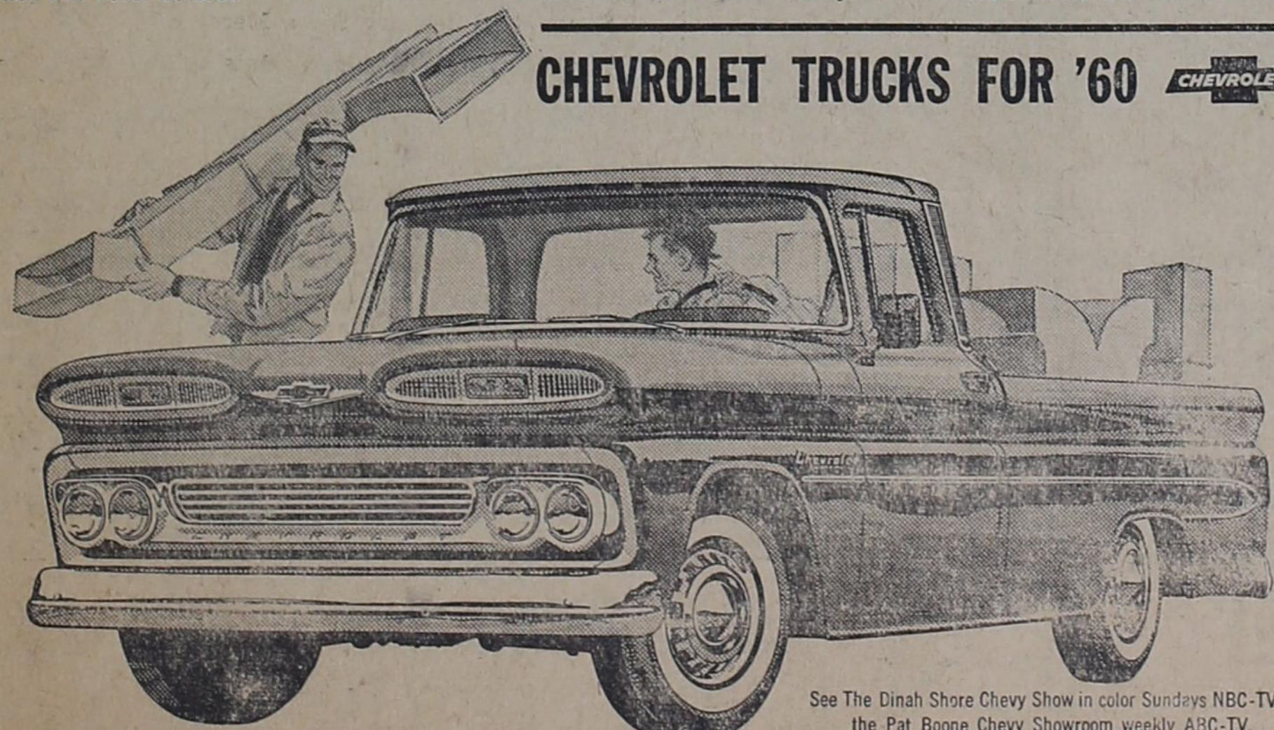
See The Dinah Shore Chevy Show in color Sundays NBC-TV—the Pat Boone Chevy Showroom weekly ABC-TV.

NOW—fast delivery, favorable deal! See your local authorized Chevrolet dealer.