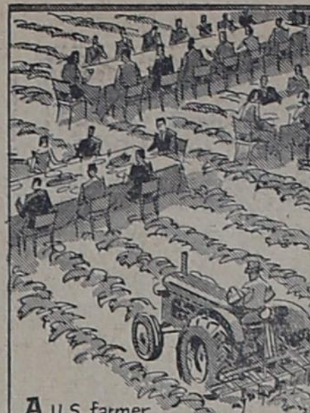
A U.S. farmer produces enough to feed himself and 23 others. In Russia a farmer produces enough to feed himself and one other.

ADVERTISING RATES Display, per Column inch - 45¢ National, less agency disc. - 56¢ Classified Advertising . . . . . 3c per word Minimum charge 50¢